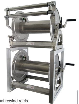
Bottom: Models SNC-18 manual rewind reels shown with optional stacking frame and rollers.