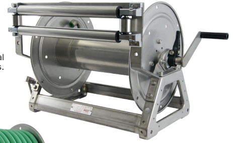
Top: Model SNC-18 manual rewind reel with optional rollers.