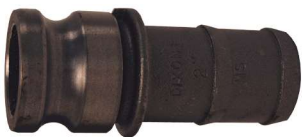
unplated malleable iron