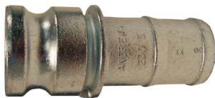
plated malleable iron