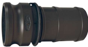
aluminum hard coat