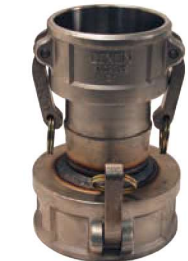
reducer / increaser