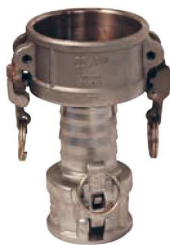
reducer / increaser