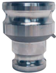
increaser / reducer